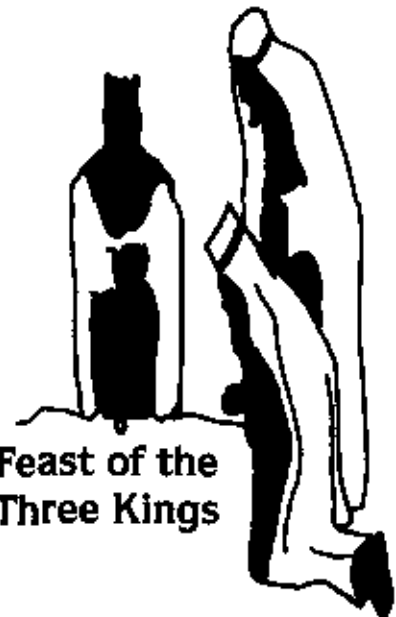
Feast of the Three Kings