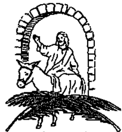
Palm Sunday April 4, 2004

Sunday, April 18, 2004, following Morning Worship. The meeting will be preceded by a catered luncheon provided by the Vestry. All heads of departments, treasurers and committee chairmen should be prepared to give reports.