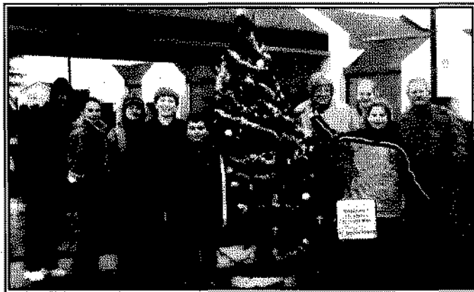
Decorating St. Andrew's Christmas tree on Oak Park Avenue, Tinley Park.